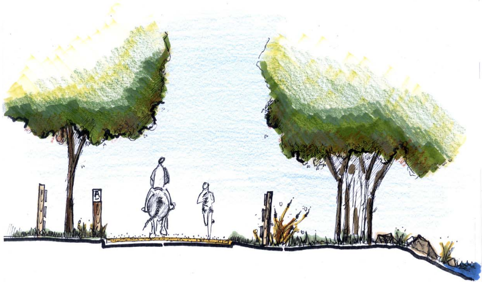
Town Branch and Equine Trail