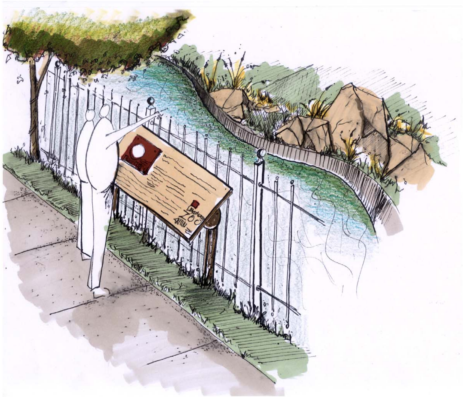
Lexington Zoo—An Educational Opportunity