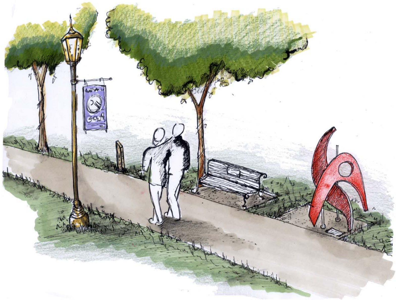
Public Art and Trail Lighting